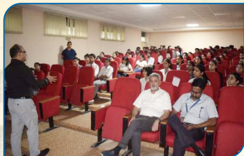
An interactive Session on Re Aim Public Health Ideas on 2nd July