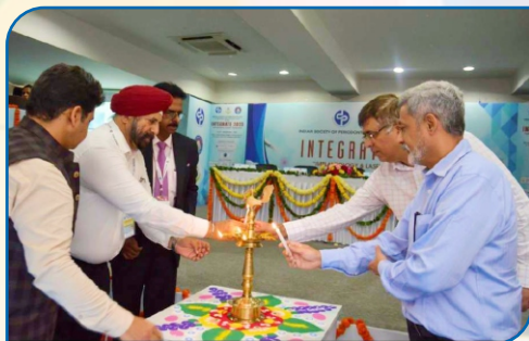
Implantology And Laser Consortium Conducted By The Department Of Periodontics On 1st & 2nd September