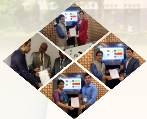
Post graduate Students from Dept. of Prosthodontics won laurels at the recently concluded 47th IPS conference