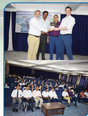
CDE Programme On Magnetic Mallet By Department Of Oral And Maxillofacial Surgery On 16th May