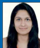
MEHAK Speciality - Prosthodontics