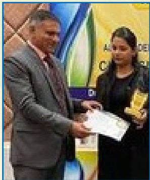
Interns for outperforming at 33rd Annual Conference of Indian Dental Association