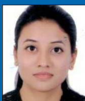
Sfurty Prakash Speciality - Pedodontics