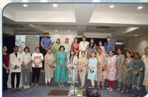
A Guest Lecture And Hands On Programme On Conscious Sedation By Department Of Pedodontics On 22nd May