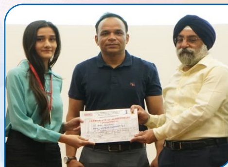
Post Graduate student from Department of Public Health Dentistry secured 3rd position in e-poster presentation.