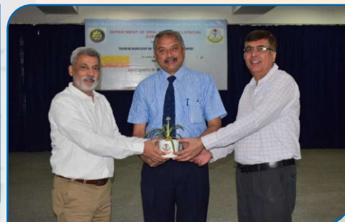
Department of Oral and Maxillofacial Surgery hosts an event on 'Tobacco De Addiction Therapies' on 26th April